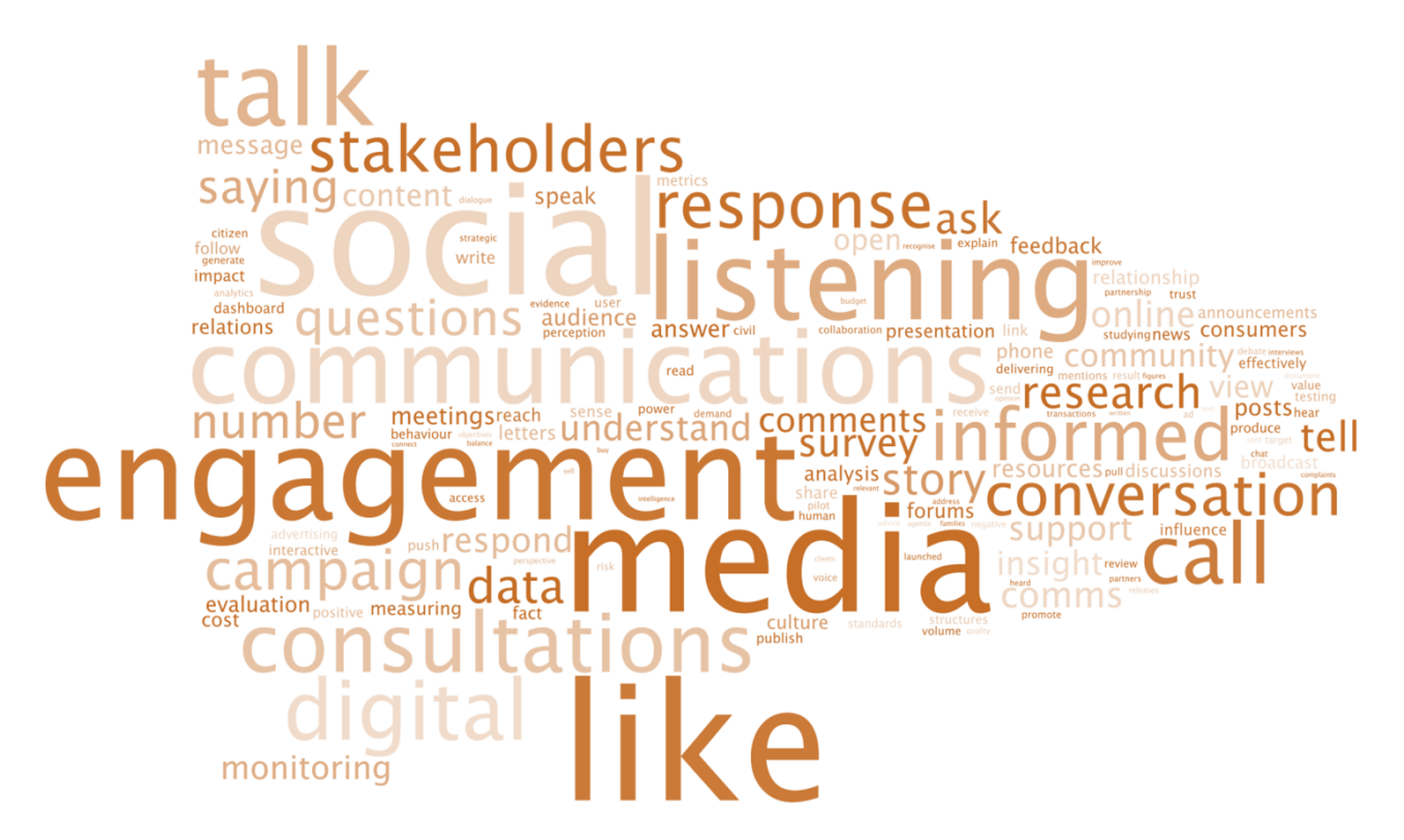
Figure 1. The main communication-related terms discussed by interviewees.

Comments by interviewees included very frequent mentions of terms such as media, communication, digital, social media, likes and liking, campaign, and story, which is unsurprising given that the research was focussed on public communication. Also, unsurprisingly given that it is a buzzword in marketing and public communication, engagement was mentioned frequently. Furthermore, because questions were asked about listening, this term appeared near the top of the list of issues discussed, as shown in the 'word cloud' derived from NVivo transcript analysis presented in Figure 1. Interviews also frequently discussed talk, call, response, conversation, being informed, consultation, and stakeholders.